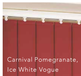
Carnival Pomegranate, Ice White Vogue