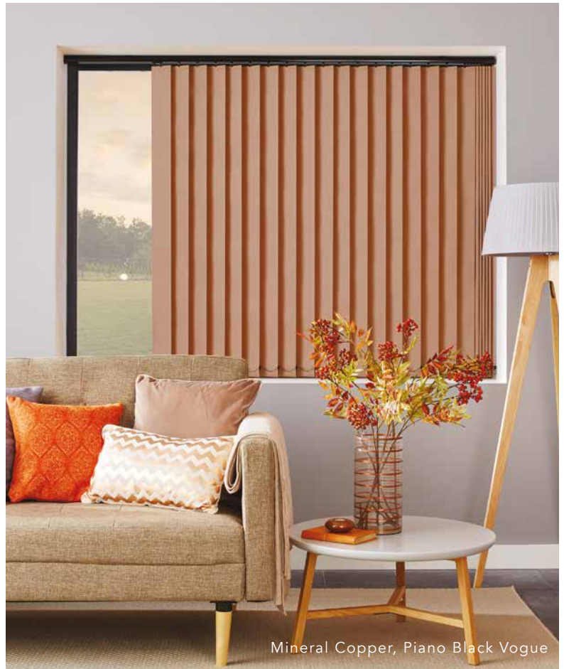
Mineral Copper, Piano Black Vogue

In addition, you have the option of sewn in weights at the bottom of the louvre, removing the need for chain and finishing off your blind perfectly.