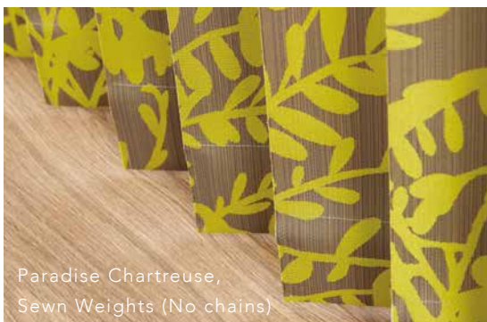
Paradise Chartreuse, Sewn Weights (No chains)