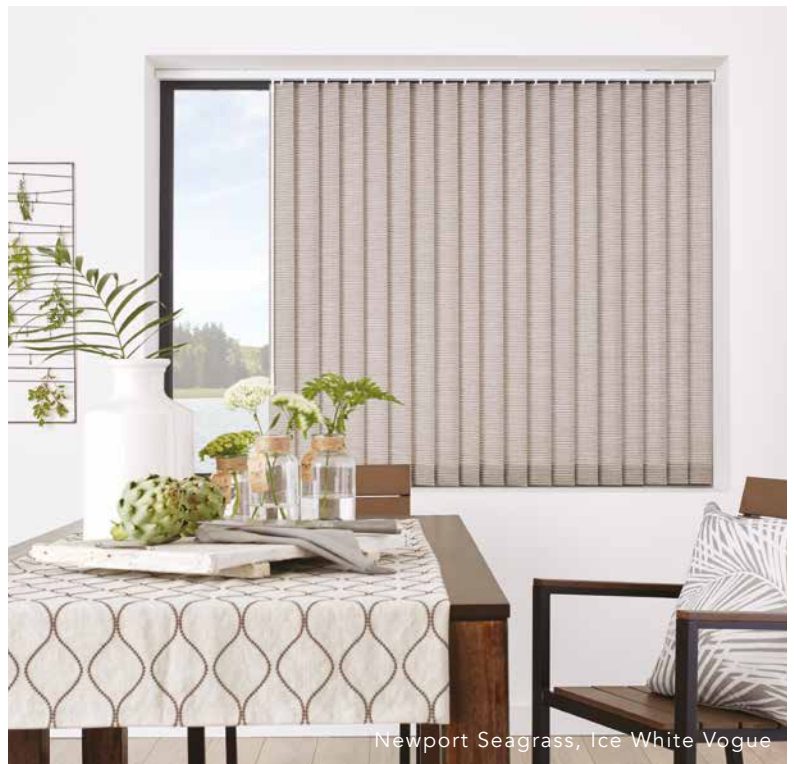
Newport Seagrass, Ice White Vogue