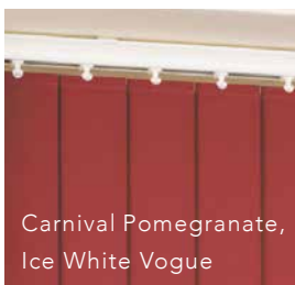
Carnival Pomegranate, Ice White Vogue